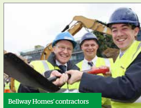
Bellway Homes' contractors