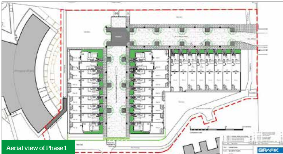
Aerial view of Phase 1