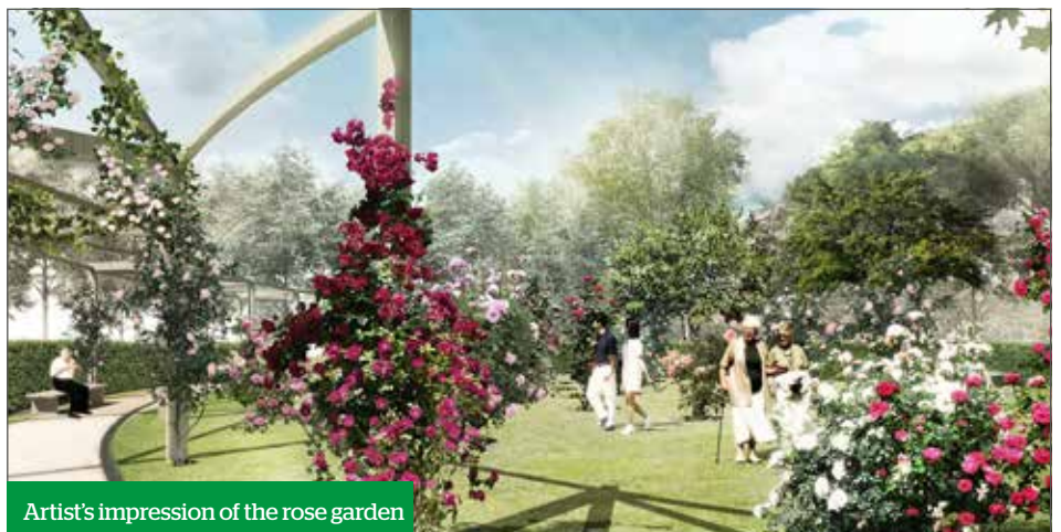
Artist's impression of the rose garden

Each home will have its own parking space, and an additional four visitors' parking spaces will also be provided.