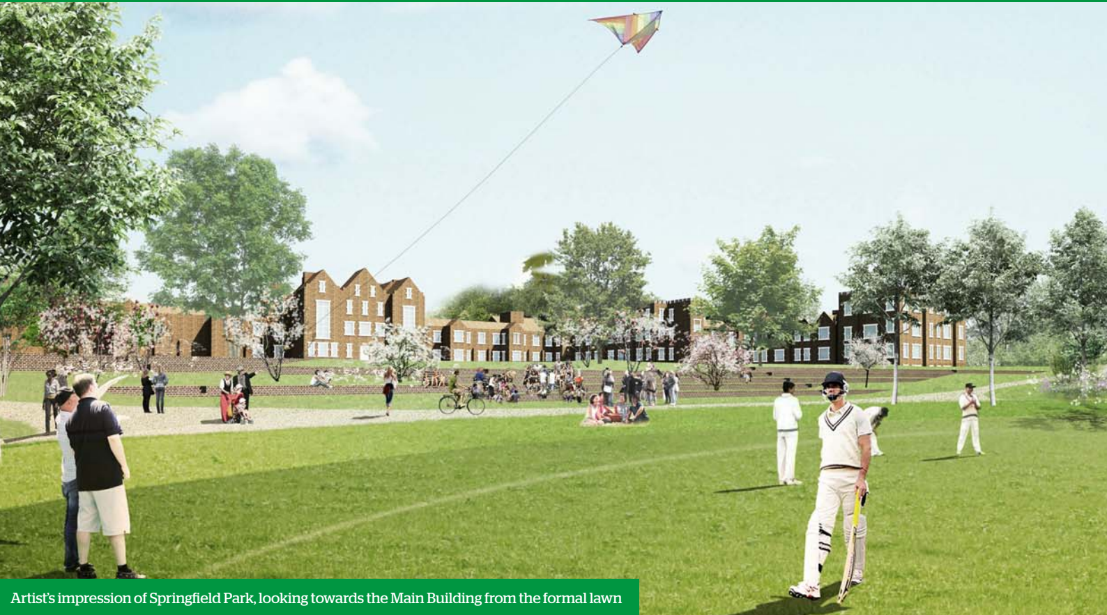
Artist's impression of Springfield Park, looking towards the Main Building from the formal lawn