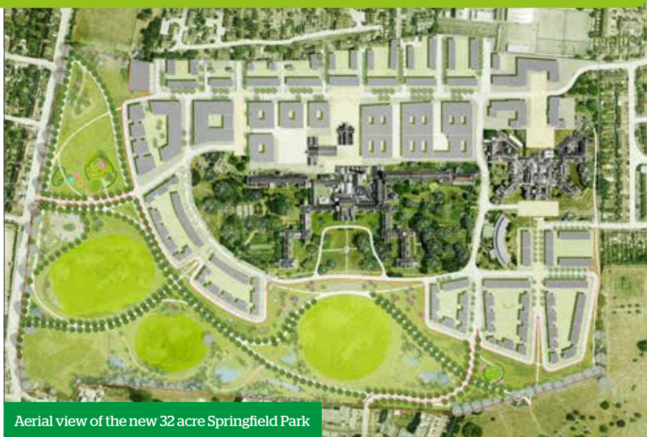
Aerial view of the new 32 acre Springfield Park

The Springfield Park strategy was formally approved by Wandsworth Council's Planning Applications Committee in December 2015. This is an important milestone and allows the development at Springfield to start.